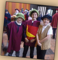
Photo wall of our exciting activities from our first half term...