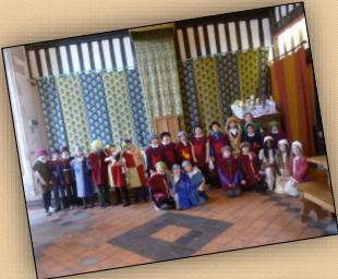
Photo wall of our exciting activities from our first half term...

Learning the times tables will continue to be a priority and reinforcing this at home will really support our work in school.